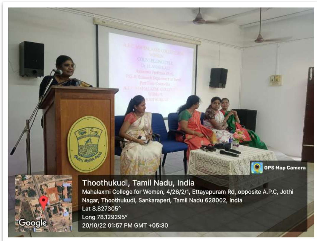
Counselors counseling the students