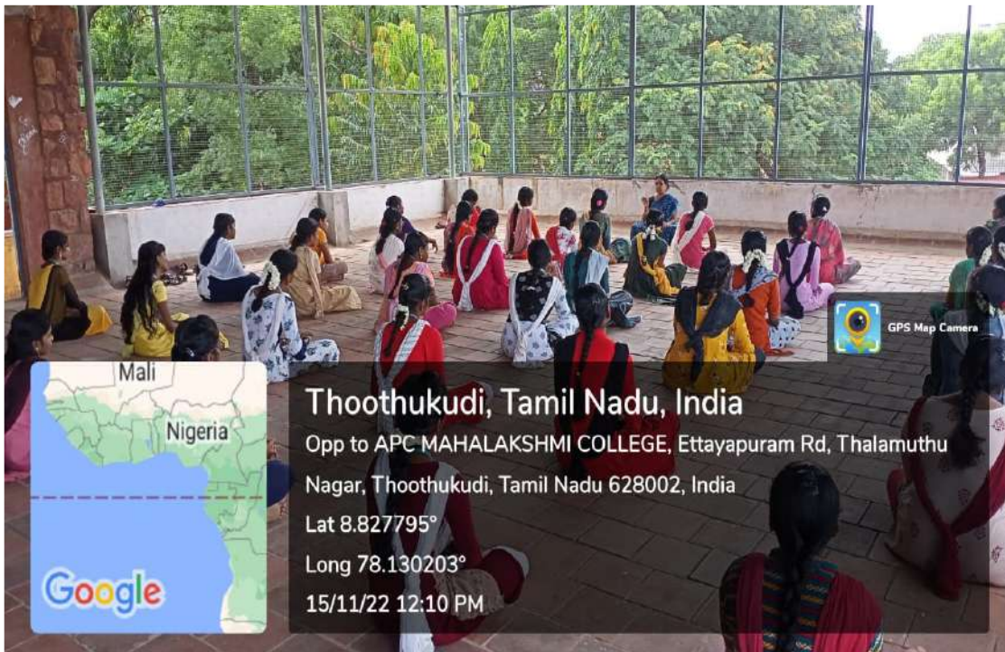
Stress relaxing facilities – Yoga class