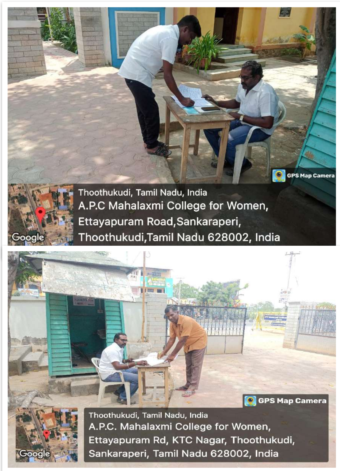
Gated secured entry point – Restricted entry of people inside the campus