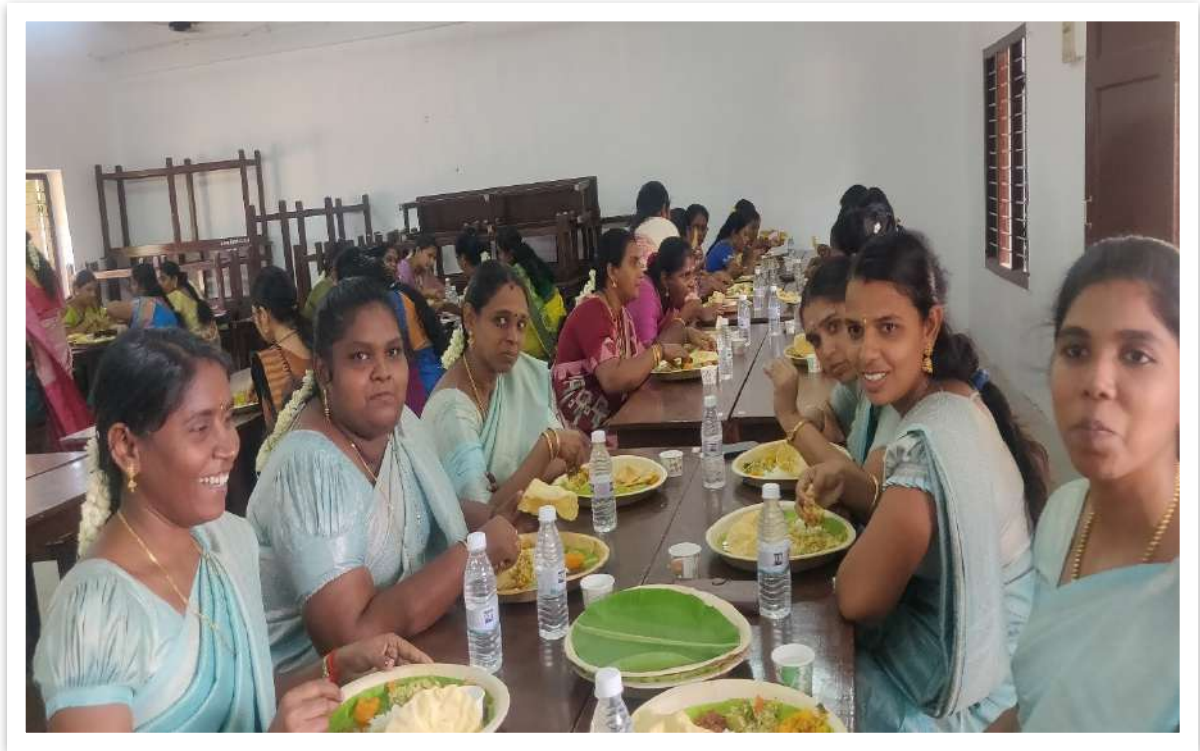
Common dining hall for staff members