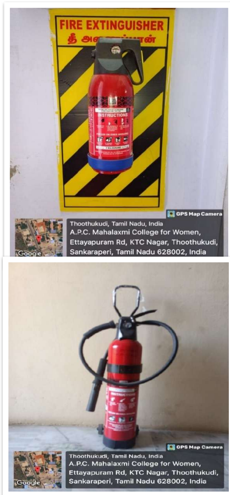
Fire extinguishers in labs