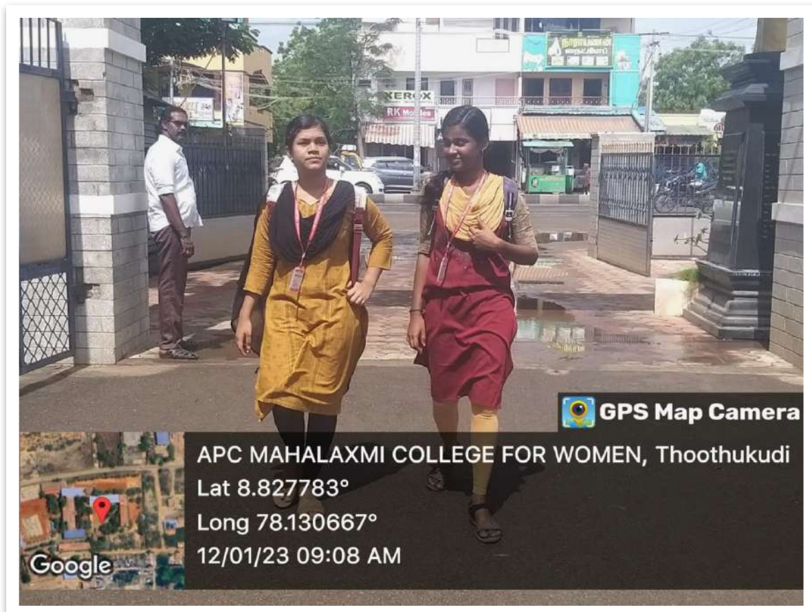
Mandatory practice of student wearing ID Card inside the college campus