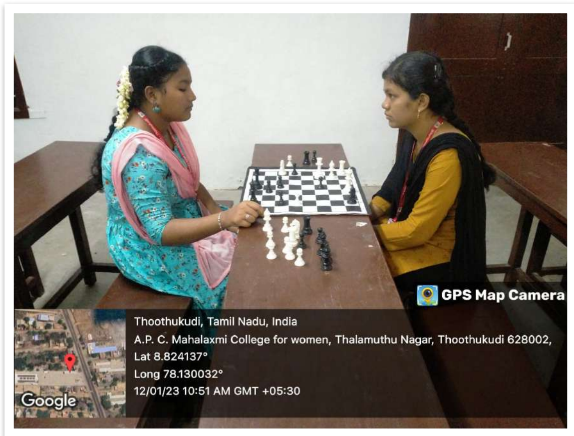
Indoor Facility: Relaxing Amenities