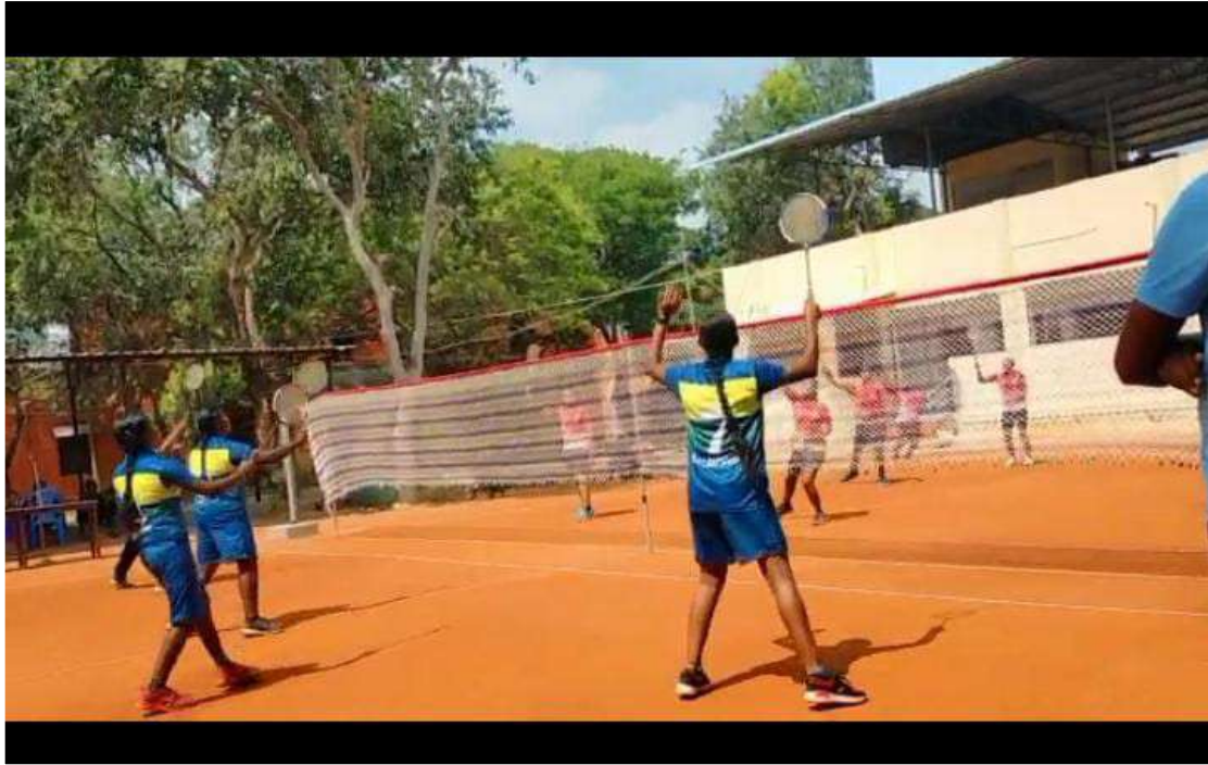
Playground for sports activities in the campus