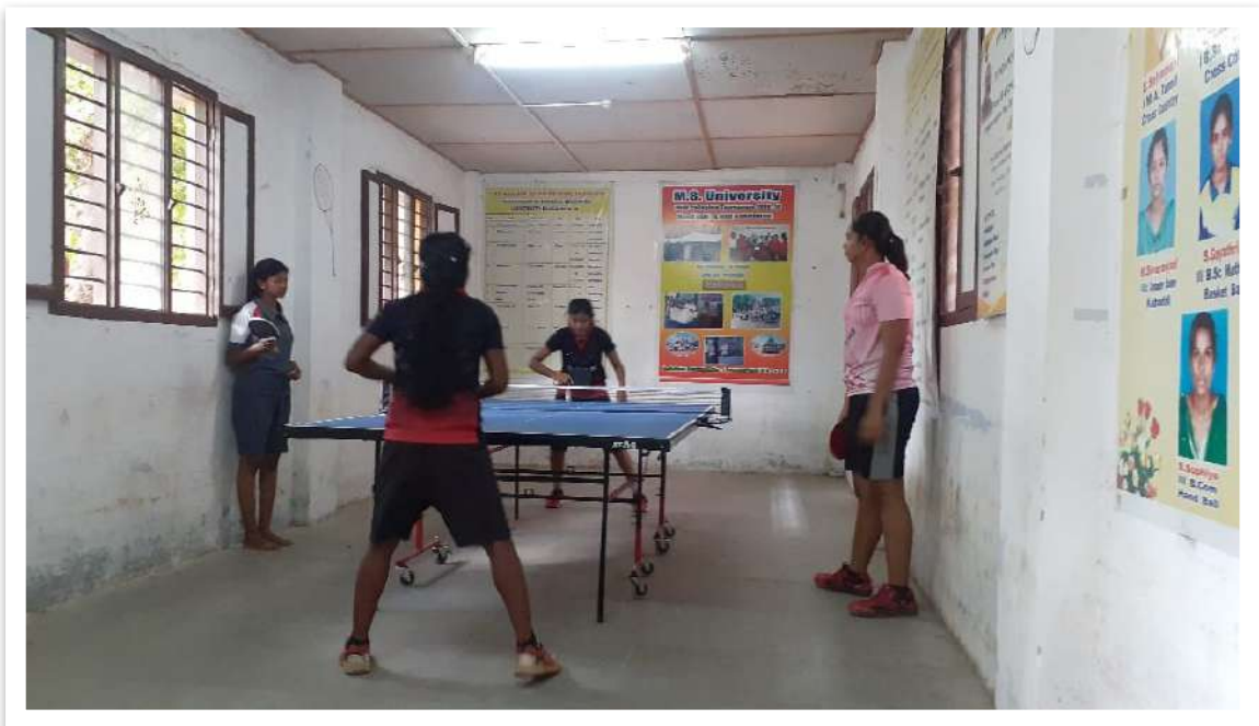
Indoor Facility: Relaxing Amenities