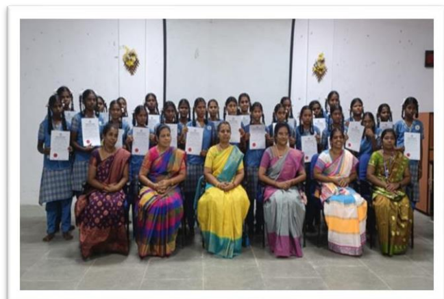
Plastic free life